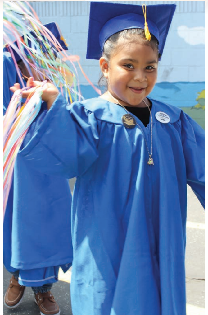
(Above) At South Central LAMP's 2022 Children Graduation, one pre-kindergarten student shows that she's on her way to kindergarten.

What has also remained constant is South Central LAMP's commitment to the South Central Los Angeles community. With its core mission to empower women and families to reach their full potential, South Central LAMP has served thousands of women and their families, altering the trajectory of their lives and the communities where they live.