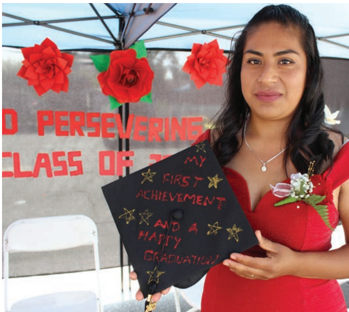
At South Central LAMP's 2022 Graduation, a mother celebrates her achievements.

In 1992, in response to civil unrest in Los Angeles, eight congregations of women religious did something that few were willing to do — they took action! Now, South Central Los Angeles Ministry Project (South Central LAMP) is blessed to turn 30 this year.