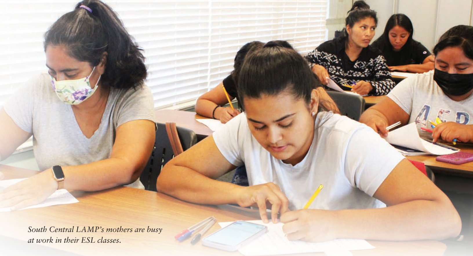
South Central LAMP's mothers are busy at work in their ESL classes.

started 30 years ago. Its approach today reflects the vision developed by the sisters, including listening to the community and responding to their changing needs. New programs are frequently added, including an afterschool STEAM program, online parenting classes in English and Spanish, a kinship program, and afternoon adult classes.